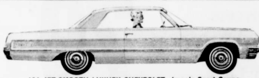
'64 JET-SMOOTH LUXURY CHEVROLET—Impala Sport Coupe