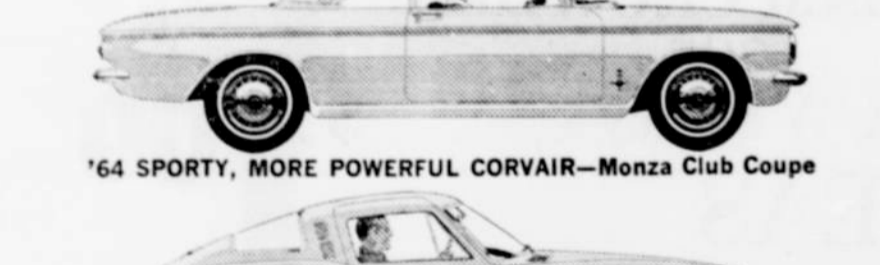
'64 SPORTY, MORE POWERFUL CORVAIR—Monza Club Coupe