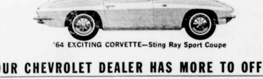
'64 EXCITING CORVETTE—Sting Ray Sport Coupe

YOUR CHEVROLET DEALER HAS MORE TO OFFER: luxury cars, thrifty cars, sport cars, sporty cars, big cars, small cars, long cars, short cars, family cars, personal cars 45 DIFFERENT MODELS OF CARS