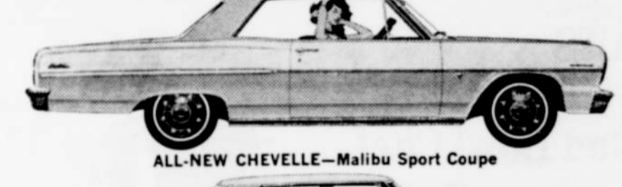
ALL-NEW CHEVELLE—Malibu Sport Coupe