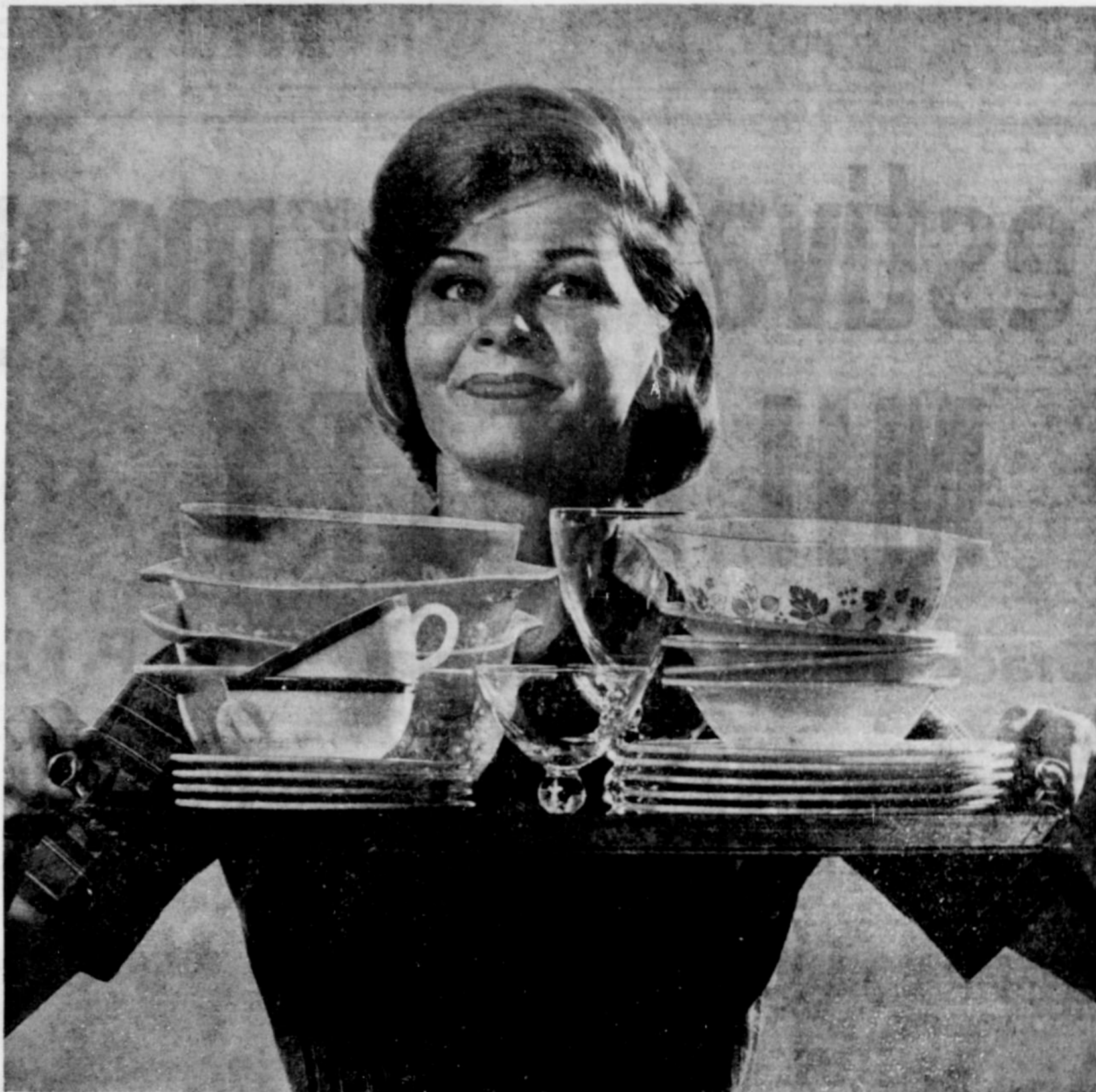
Pacific Powerland housewife, whose husband's name is Joe, confesses: