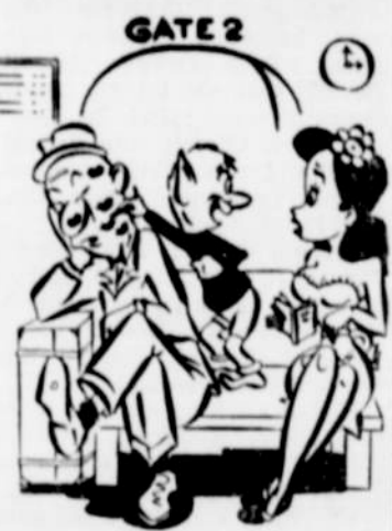
"Watch the fireworks when his wife comes back."