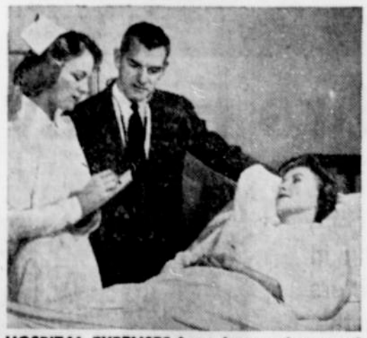
HOSPITAL EXPENSES have been going up at the rate of nearly 1% a month since 1950. An American Republic Plan can help pay these bills when you need money most.

On its record of paying claims—the most important way to judge any insurance company—American Republic ranks Number One among the "Top 40" firms in its field. The few minutes it takes you to learn about American Republic "Tailored" Protection may be worth hundreds of dollars to you—at a time when you may need every cent you can lay your hands on!