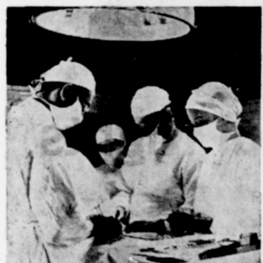
SURGEONS' BILLS, TOO , can wreck a family budget. An American Republic Plan can help pay the costs of operations. Look for the man who can explain these plans to you.