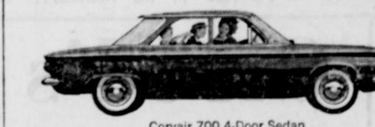
Corvair 700 4-Door Sedan

If you haven't driven it yet, you don't know what a delight driving can be. Its steering, response, traction and roadability are unique because it's a unique car —the only U.S. car with an air-cooled airplane-type rear engine, transaxle and independent suspension at all four wheels. Be in on the know. Find out what delightful differences this advanced design makes.