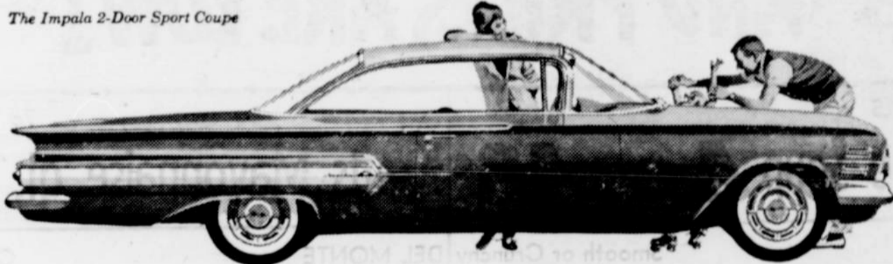
The Impala 2-Door Sport Coupe