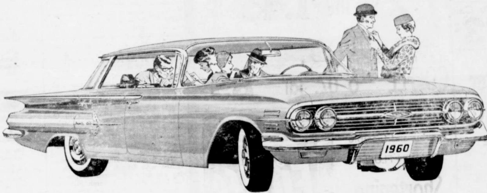
Elegant Impala 4-Door Sport Sedan—one of 16 spanking new Chevrolets you can choose from.

ELEGANT! QUIET! SMOOTH! LUXURIOUS! ENDURING! SUPERB! SPIRITED! JOYFUL!