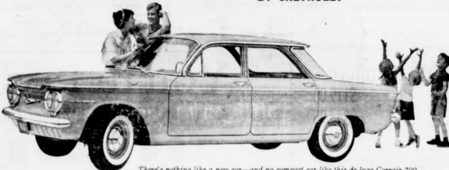
There's nothing like a new car—and no compact car like this de luxe Corvair 700.

America's only car with an airplane-type horizontal engine! America's only car with independent suspension at all 4 wheels! America's only car with an air-cooled aluminum engine!