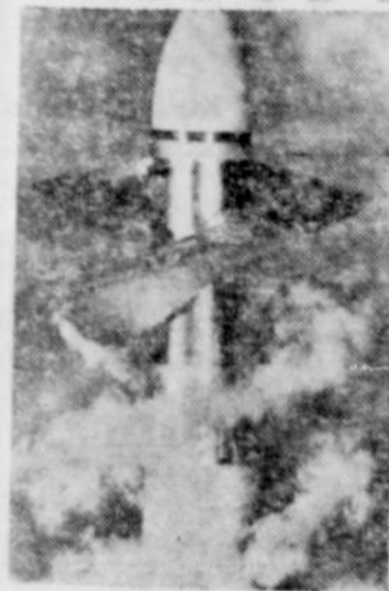
Rocket? Missile? Guess again—it's a new kind of propeller developed by the U. S. Navy, providing greatly increased thrust over conventional designs.

—THE MILL CITY ENTERPRISE THURSDAY, MARCH 5, 1959