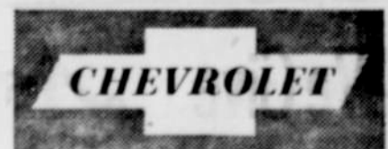
The smart switch is to the '59 Chevy!

the super-softness of Full Coil springing, in Easy-Ratio steering—then you'll know that this is the happiest surprise of the year. Come on in; don't miss this Open House!