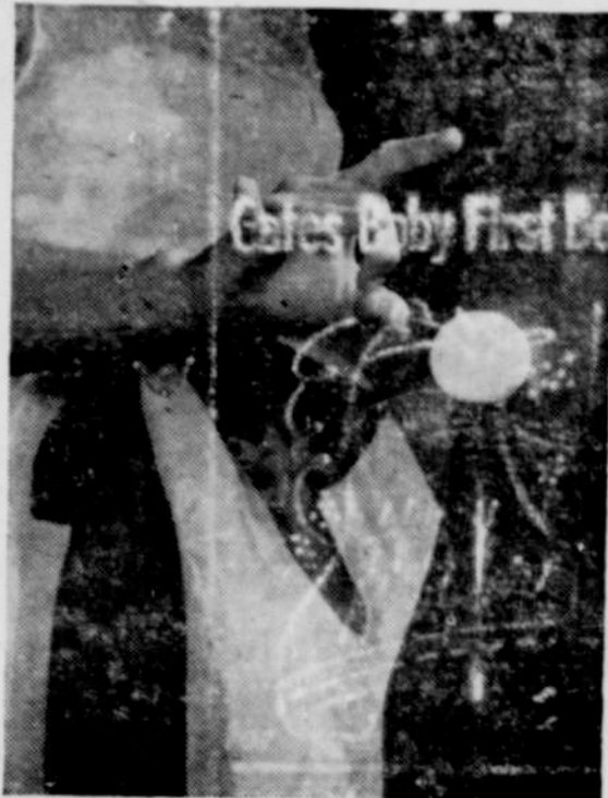
Want a new game for your parties? Place a ping-pong ball on top of an empty bottle near the edge of a table. Now, from a point six or eight paces back from the table, have your guests walk quickly past the bottle and, without slackening their pace, flick the ball off with a finger. Sound easy? Try it. Remember, contestants must not slow down or stop to shoot. Hint: aim at the bottom half of the ball.