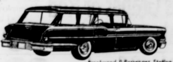
Brookwood 9-Passenger Station Wagon

Every window of every Chevrolet is Safety Plate Glass.