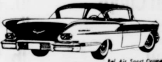
Bel Air Sport Coupe