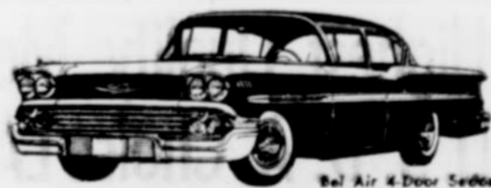
Bel Air 4-Door Sedan

CHEVY COSTS LESS IN ALL THESE POPULAR MODELS!*