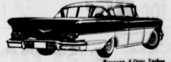
Biscayne 4-Door Sedan