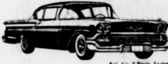
Bel Air 2-Door Sedan