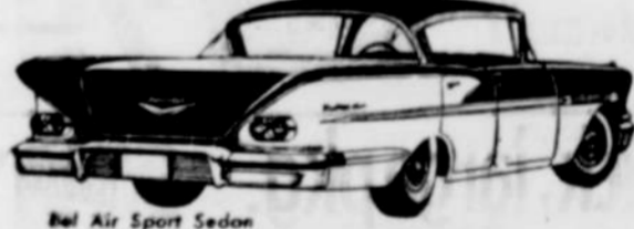
Bel Air Sport Sedan