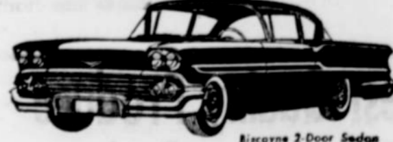
Biscayne 2-Door Sedan