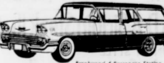
Brookwood 6-Passenger Station Wagon