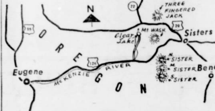
Highway 126 follows the white water of the McKenzie and near Bend skirts to the north of the scenic Three Sisters.

standing on the cabin porch and dropping a line directly into the McKenzie.