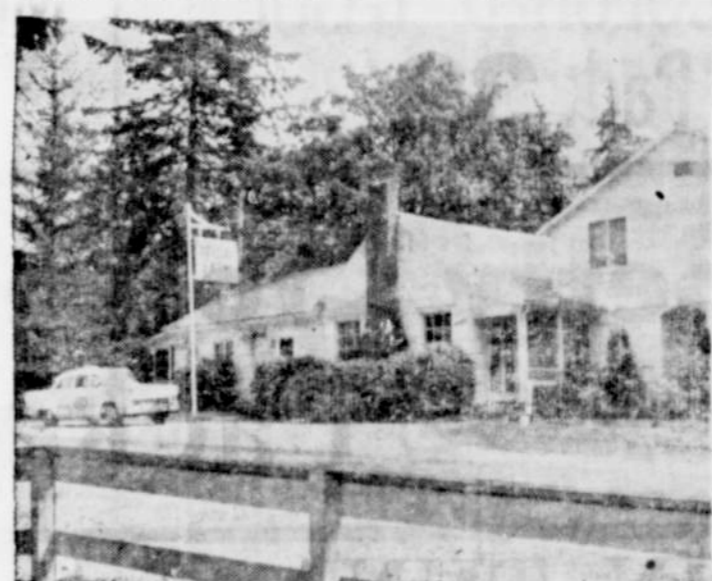
The white motorlog car visits Holiday Farm, one of the many modern tourist accommodations in the McKenzie area.

Here, then, is a vacation land with an enchanting and seductive past, once a "cinder box of Hades," now a Thoreau-like land of surprises, like heated swimming pools, an air strip for winged travelers, good roads, covered bridges, restaurants, first-class motels and cabins, beauty parlors and cocktail lounges.