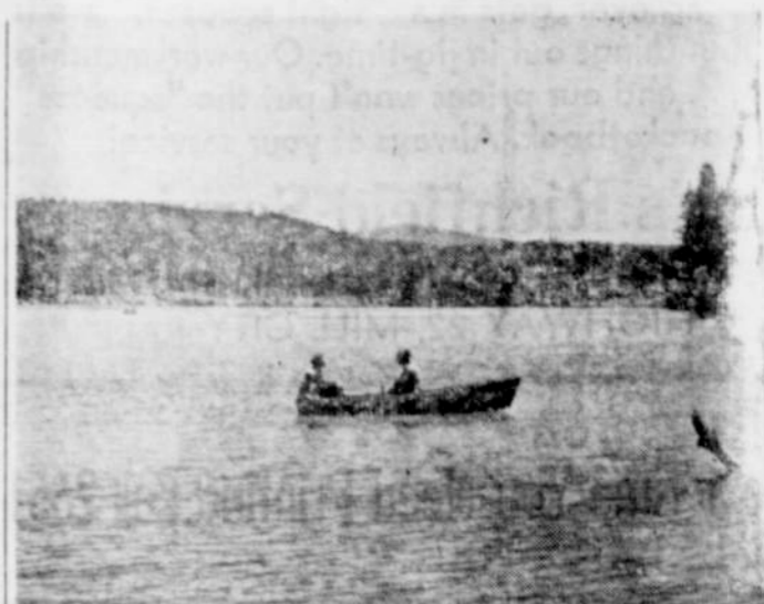
Lava flows dammed the Upper McKenzie creating Clear lake. In its depths, an ancient, drowned forest can be seen.

We stayed at Laughing Waters in a two-bedroom cabin, done in natural wood and sporting a huge stone fireplace in the living room. A furnished kitchen had clean, ample facilities for meals, which could be topped off with rainbow, cutthroat and Dolly Varden trout, caught easily by