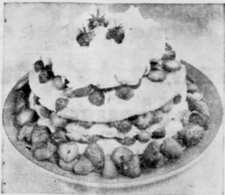
GOOD 'N PLENTY is the order of the month as Oregon acknowledges the official Strawberry Shortcake Week, June 16 to 23. There is nothing more typical of the Northwest than Strawberry Shortcake which features Oregon wheat flour products, fresh Oregon strawberries and Oregon dairy goods.

FOR YOUR TELEVISION OR RADIO Phone 3207 or UL 9-2191 We Specialize in Philco, Motorola, Admiral Stiffler's Radio and Appliance Co.