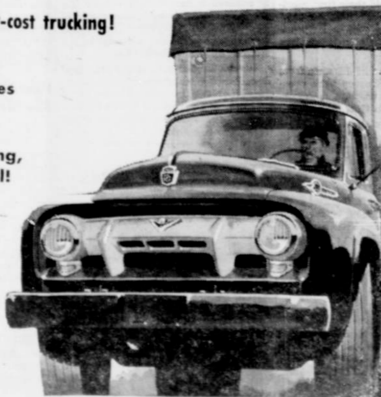
New Ford F-900 Six Cyl., G.V.W. 27,000 lbs., G.C.W. 54,000 lbs.