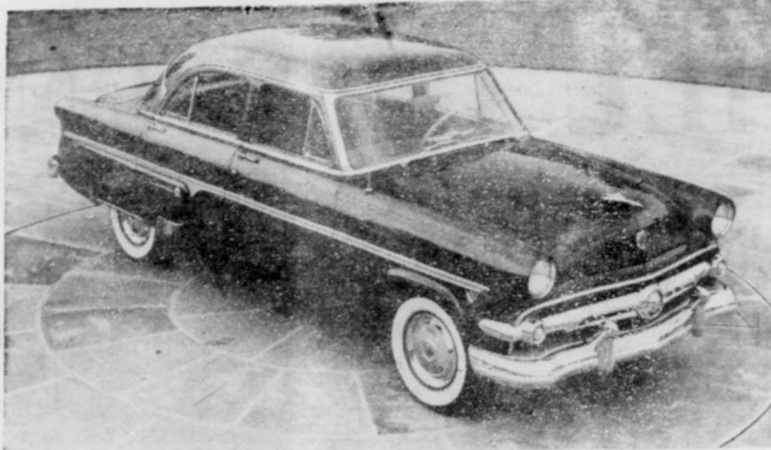
This 1954 Ford Crestline Fordor sedan—new this year—has interior beauty and new power assists usually found only in costly limousines. Its smart new grille has a characteristic Ford center spinner, recessed parking lights and jet-type air scoop. Like all 1954 Ford passenger cars, it has new ball-joint front suspension for easier handling and the choice of either Ford's completely new 130-h.p. V-block V-8 engine or the new 115-h.p. I-block Mileage Maker Six. For ease and driving pleasure it has power steering, power brakes, power operated windows and front seat, plus Fordomatic or overdrive, available at extra cost.