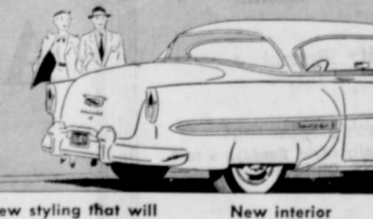
New styling that will stay new

Stop in and take a good look at the bestlooking Chevrolet you ever saw!