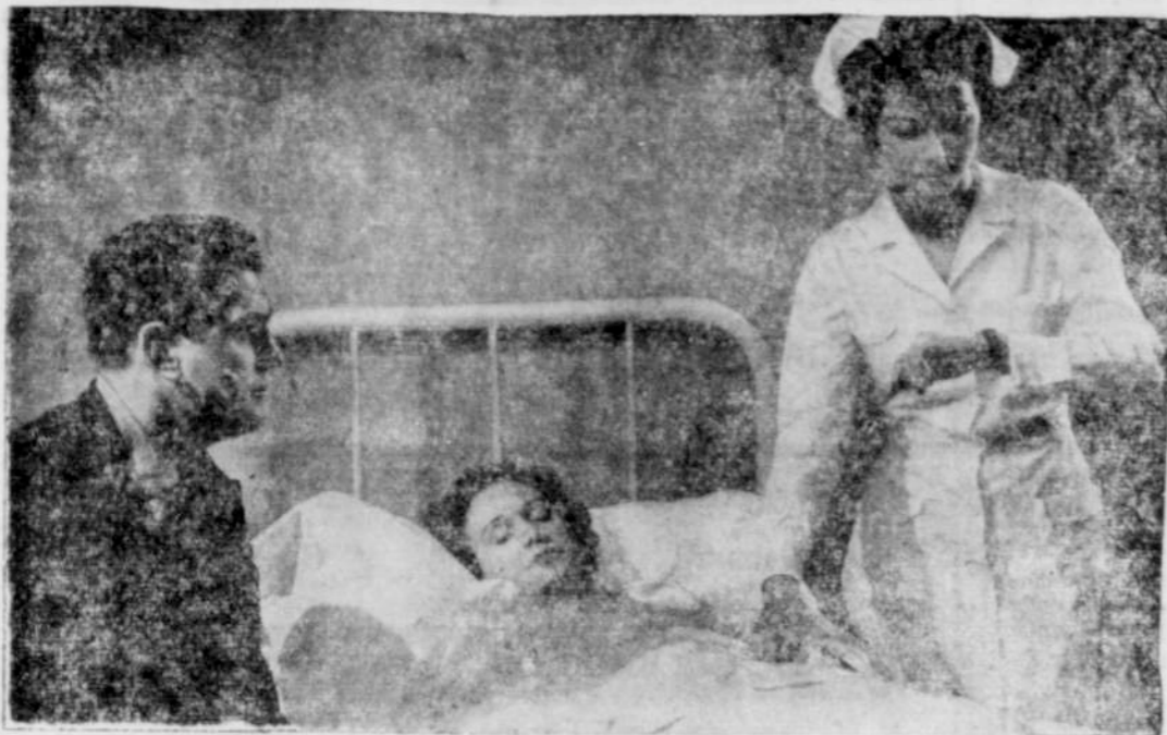
HOSPITAL BOARD AND ROOM