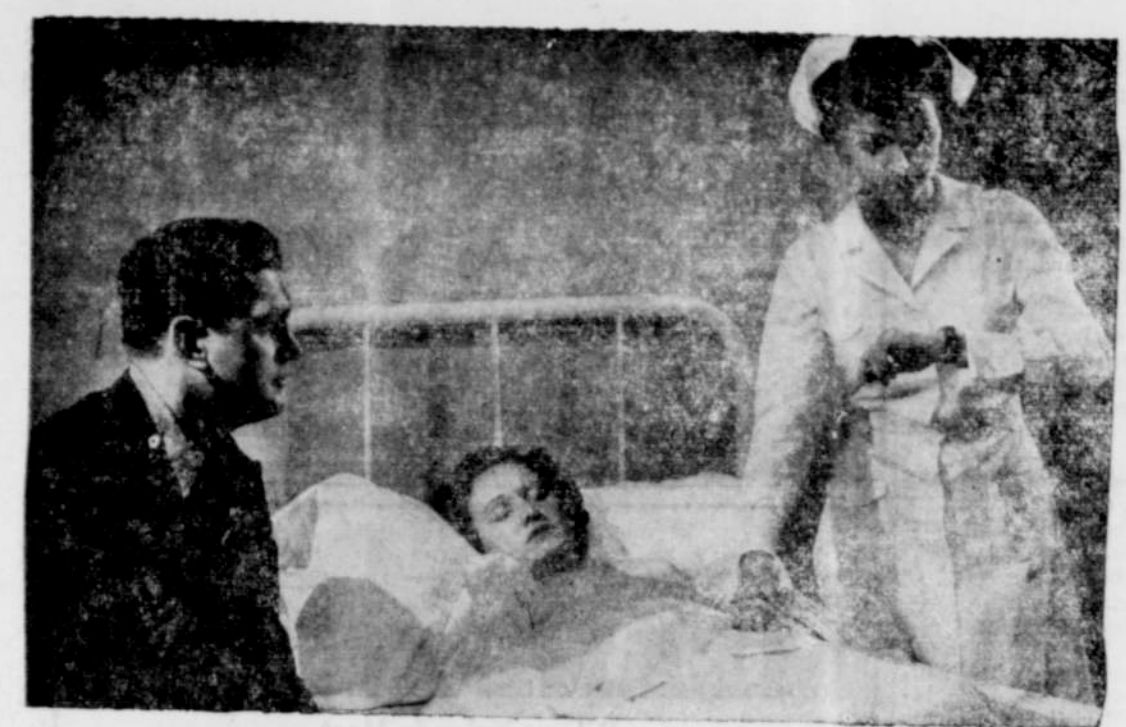
HOSPITAL BOARD AND ROOM