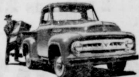
Ford F-100 Pickup, G. V. W., 4,800 lbs. V-8 or Six, Deluxe Cab (extra cost) shown.

And because new Ford Pickup sales are soaring, your Ford Dealer can now give you an extra-generous trade-in allowance on your old truck. So, drive in! See him today!