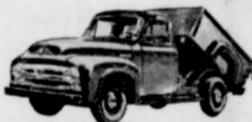
Dump conversion turns Ford Pickup into powered hydraulic dump truck. Mount does not increase loading height. Dumps heaviest loads a Pickup can handle.