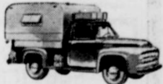
Coach unit provides living quarters for three adults. Has built-in galley, dinette, cupboards, closet. Fine for vacationers, pipeline crews, range work on ranch.