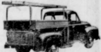
Utility bodies provide racks and compartments for tools and equipment. Many types available for plumbers, electricians, maintenance crews, builders, landscapers, painters, contractors.