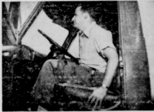
SLIDE into the wide, comfortable seat. Bounce on it to test the super-cushioning action of Ford's exclusive seat shock snubber and new non-sag springs.