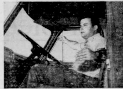
STRETCH your arms into big-cab roominess. Ford's got more hip room than any of the five other leading makes. Man, what a treat this cab is for a working guy!