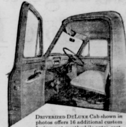
DRIVERIZED DeLuxe Cab shown in photos offers 16 additional custom features at worthwhile extra cost.

Only Ford Trucks give you DRIVERIZED CAB COMFORT