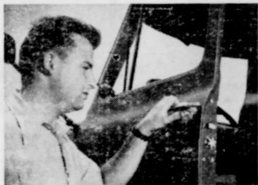
SWING open the new wider doors! Door handles are the easy-operating, push-button type . . . the kind you get on quality cars. Door latches are new rotor type.

Before you buy any truck . . . make the 15-second SIT DOWN TEST! You can see and feel instantly , how Ford has combined truck ruggedness and performance with the comfort a driver deserves!