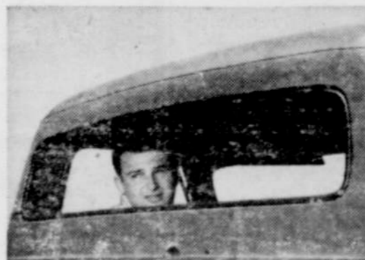
GLANCE back through the 4-ft. rear window. See where you're backing, without leaning. Ford Trucks have more glass area than any of the five other leading truck makes.