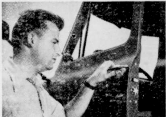
SWING open the new wider doors! Door handles are the easy-operating, push-button type . . . the kind you get on quality cars. Door latches are new rotor type.

Before you buy any truck . . . make the 15-second SIT DOWN TEST! You can see and feel instantly , how Ford has combined truck ruggedness and performance with the comfort a driver deserves!