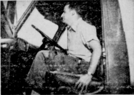
SLIDE into the wide, comfortable seat. Bounce on it to test the super-cushioning action of Ford's exclusive seat shock snubber and new non-sag springs.