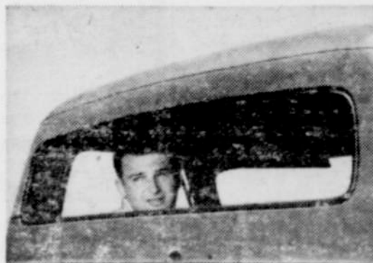
GLANCE back through the 4-ft. rear window. See where you're backing, without leaning. Ford Trucks have more glass area than any of the five other leading truck makes.