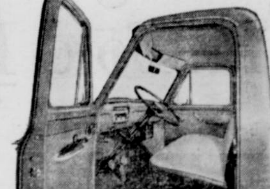
DRIVERIZED DeLuxe Cab shown in photos offers 16 additional custom features at worthwhile extra cost.

Only Ford Trucks give you DRIVERIZED CAB COMFORT