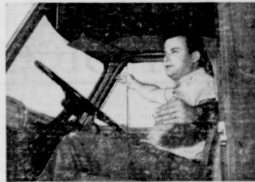
STRETCH your arms into big-cab roominess. Ford's got more hip room than any of the five other leading makes. Man, what a treat this cab is for a working guy!