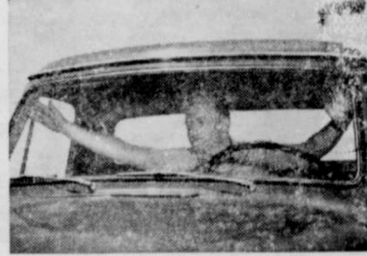
SWEEP your eyes across the new curved one-piece windshield. With picture-window visibility like this you can really navigate. Safer driving, of course! Less eyestrain!