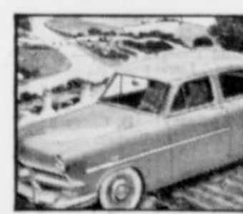
the road the better your Ford likes it because Ford's new "ride" cuts front end road shock alone up to 80% . . . babies you over the bumps . : and cuts sidesway on turns.