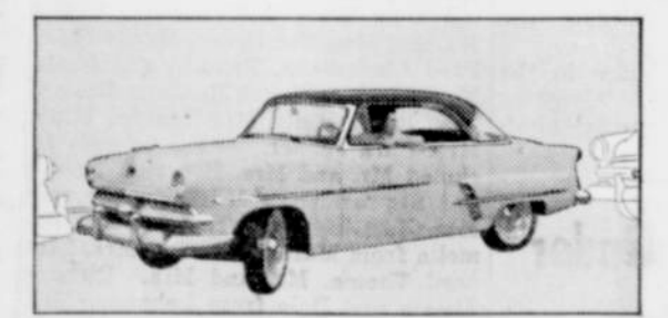
'Best buy" in power steering! Ford's Master-Guide (available on all V-8 models) supplies hydraulic "muscles"-automatically whenever you need them-to do the work of steering for you. All you do is guide the car. Makes all driving easier, and safer. And parking's so easy!