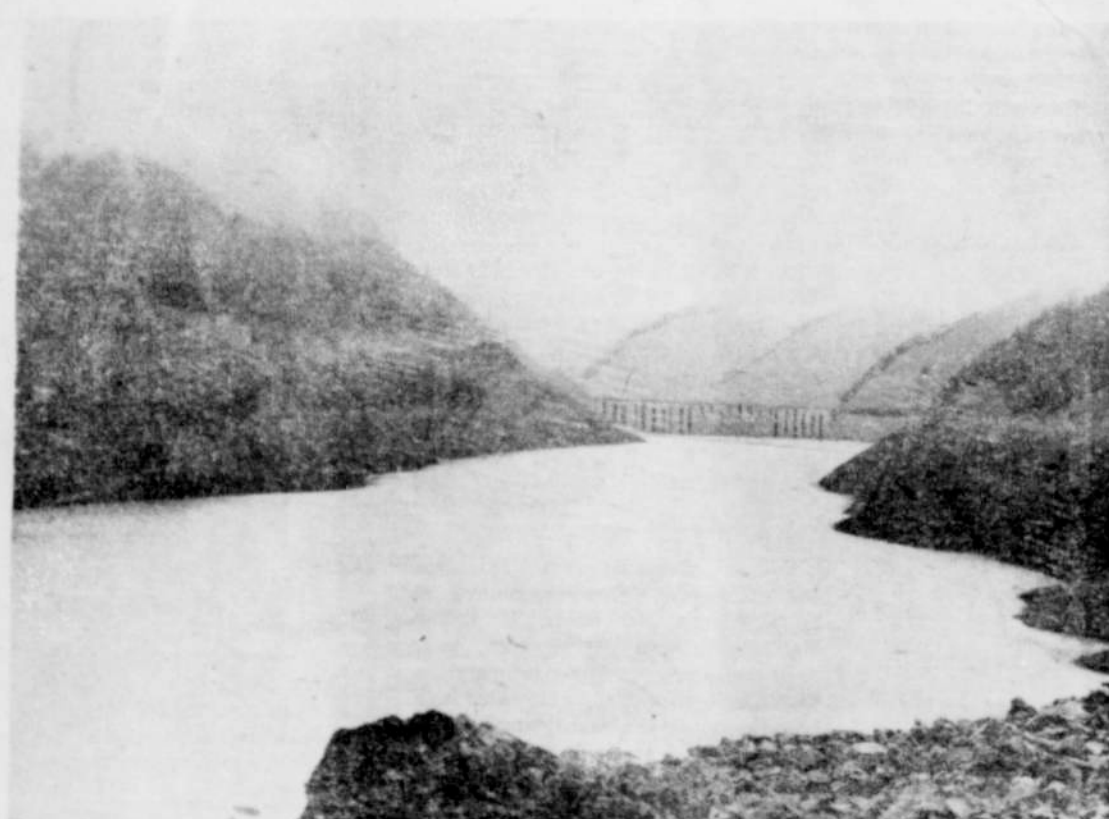
VIEW OF DETROIT LAKE