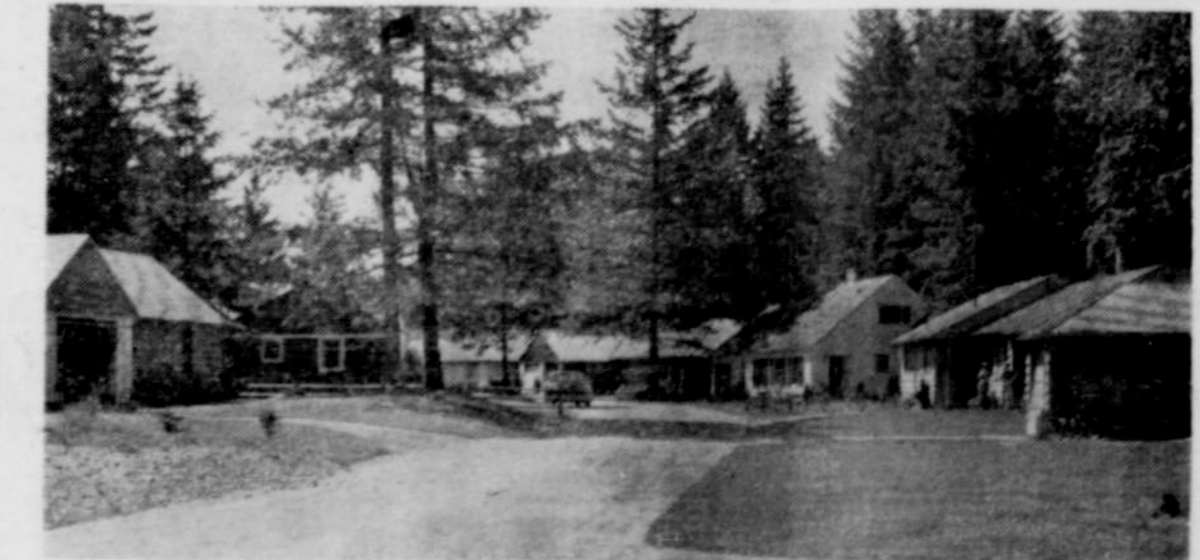
C.B.I., Detroit Dam contractors, housed their engineer personnel in these attractive Mill City homes in what is yet known as C.B.I. area or Kaiser Court. Army Engineers have purchased part of these homes for the personnel who will operate Detroit Dam.