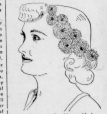
Flowers in Your Hair

Before wearing flowers, it is a good idea to place them in cold water for two hours or longer. Remember, you want them to look fresh and perky.