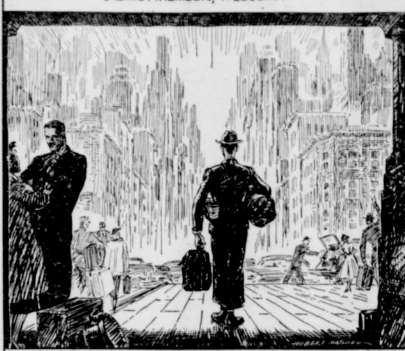
THE ANONYMOUS IMMIGRANT WHO WALKED OFF THE BOAT YESTERDAY, OR LAST WEEK, OR LAST YEAR, EAGER TO BREATHE THE SWEET AIR OF FREEDOM, MAY NOT BE ANONYMOUS FOR LONG. BECAUSE THERE IS NO CEILING HERE ON OPPORTUNITY, HE MAY BE ANOTHER CARL SCHURZ.