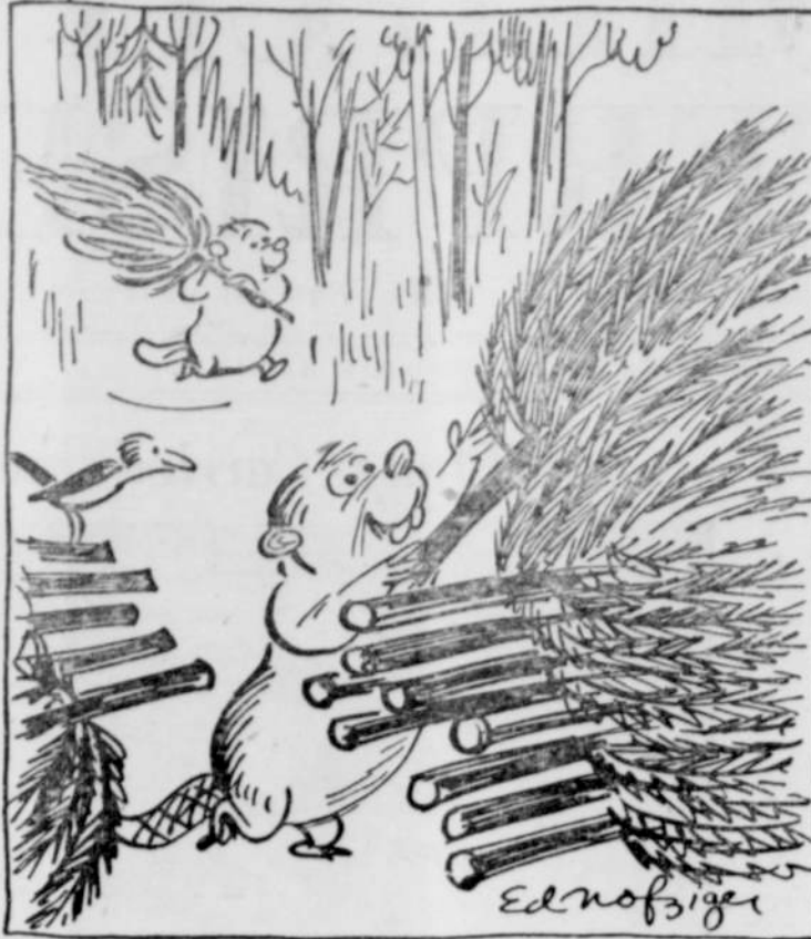
Forest Service, U. S. Department of Agriculture

"The proper harvesting of Christmas trees is consistent with good forest conservation—and think of the joy it brings."