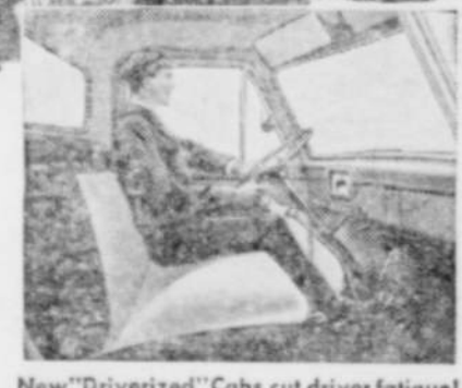
New "Driverized" Cabs cut driver fatigue! New wider seat with non-sag springs and counter-shock seat snubber!

Now, Synchro-Silent transmission standard on all Ford Trucks . . . in 3-, 4- and 5-speed types . . . no double-clutching . . . easier shifting . . . GET JOBS DONE FAST! And all 3-speed transmissions have steering column shift for passenger-car shifting ease! Also, Fordomatic—the fully automatic transmission—or Overdrive are available on all half-ton models at extra cost!