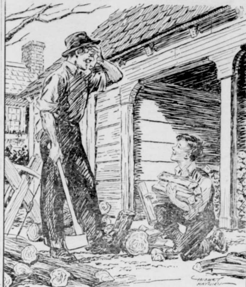
INDUSTRY AND FORESIGHT ALWAYS LOOK BEYOND TODAY TO TOMORROW. THE GOOD PROVIDER NOT ONLY CONSIDERS PRESENT NEEDS, BUT WILL SEEK-THROUGH LIFE INSURANCE AND SAVINGS, TO MAKE THE FUTURE COMFORTABLE AND SECURE.

COME SIGNS OF WINTER, THE SIZE OF A MAN'S WOODPILE, HOW CONVENIENTLY STACKED FOR READY USE, IS A PRETTY GOOD SIGN TO COUNTRY FOLK OF HIS INDUSTRY AND FORESIGHT IN PROVIDING FOR THE SEASON