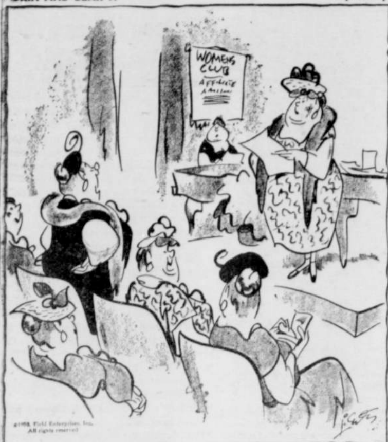
"We'll have a chorus of joyful song when we've asked all the business and professional men to get Bonds regularly on the Bond-A-Month Plan."

— GET YOUR QUALITY JOB PRINTING AT THE ENTERPRISE —