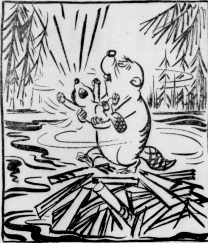
Forest Service, U. S. Department of Agriculture

"Oh, quiet! Your mother is out on a conservation job—planting trees with some club women."