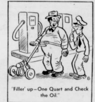
"Filler" up—One Quart and Check the Oil."

WEDDING ANNOUNCEMENTS AND INVITATIONS at The Mill City Enterprise