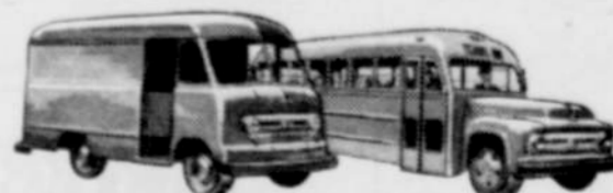
2 Parcel Delivery P-Series