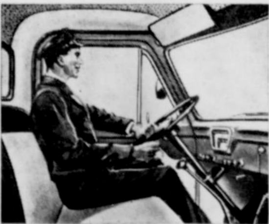
NEW "DRIVERIZED" CABS CUT DRIVER FATIGUE!

New wider, adjustable seat with new non-sag springs, new seat shock snubber for a smoother ride! New one-piece curved windshield, 55% bigger! New push-button door handles, new rotor door latches! New full-width rear window—4 ft. wide!