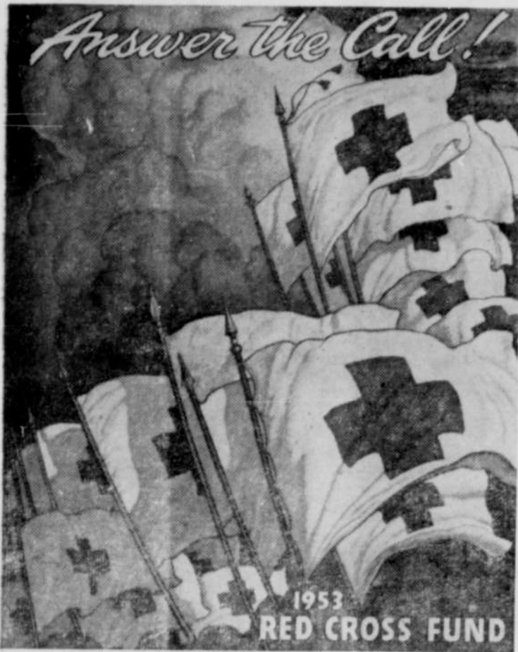
The "marching flags" poster of the late N. C. Wyeth, first used by the Red Cross in 1933 and repeated in 1947, will be used again as the poster of the 1953 Fund Campaign because of its great popularity. Repeated also is last year's slogan, "Answer the Call."