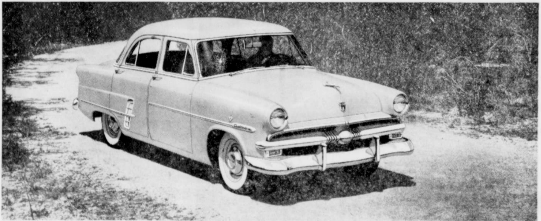
White sidewall tires optional at extra cost. Equipment, accessories and trim subject to change without notice.

bounce, pitch and sway to bother you, no uncomfortable roll on curves. Ford's new Miracle Ride marks a new era of riding comfort and quiet. It's another big reason why Ford is worth more when you buy it ... worth more when you sell it!