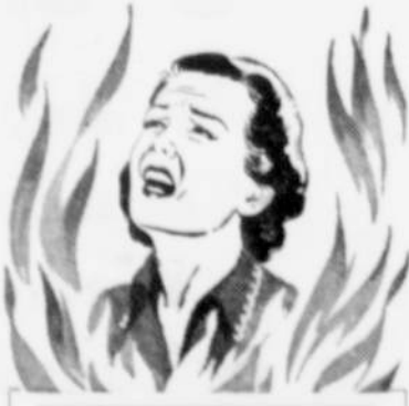
How Lydia Pinkham's works. It acts through a woman's sympathetic nervous system to give relief from the "hot flashes" and other functionally-caused distresses of "change of life."

Try Lydia Pinkham's on the basis of medical evidence! See if you, too, don't gain blessed relief from those terrible "hot