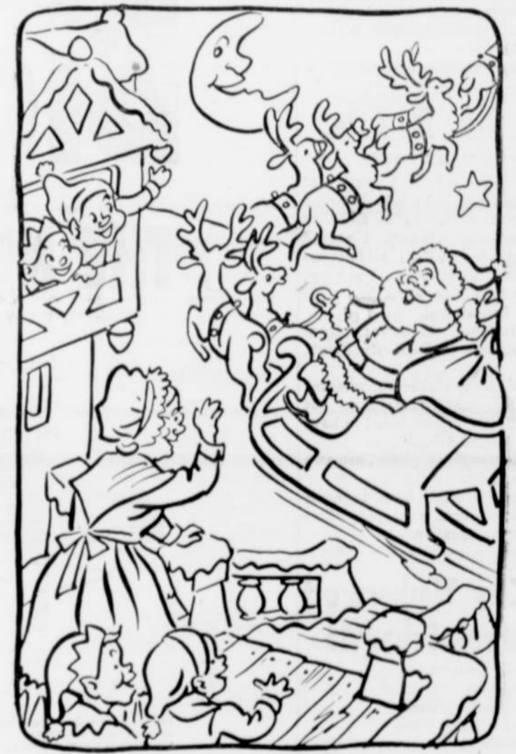
G ODSPEED! GOODBYE! HIS HELPERS CRY!

Quality Meats and Groceries FOOD LOCKERS FROZEN FOODS