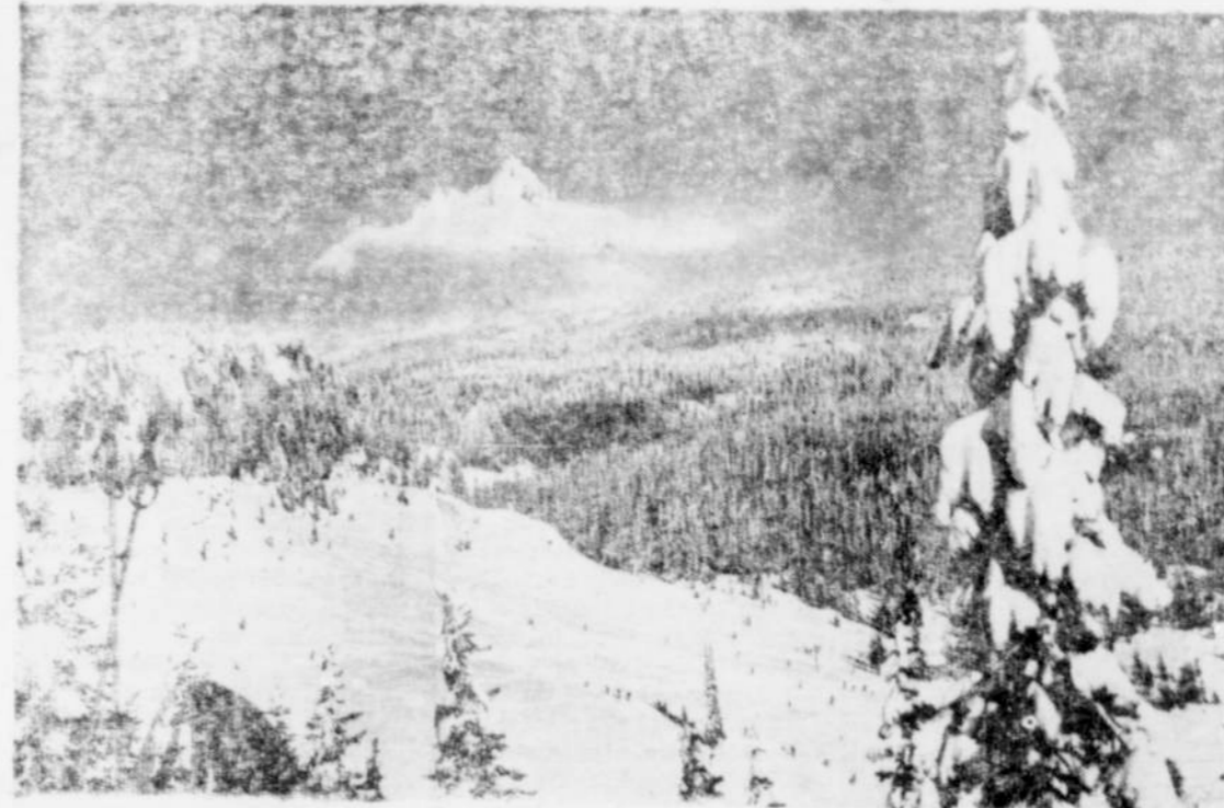
Recent heavy snows and freezing temperatures in the mountains have provided Oregon's thousands of skiers with some great outdoor sport.

Detroit—The Detroit Church of Christ will present a Christmas program for the public Sunday evening, December 21 at 7 p.m.