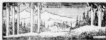
KEEP OREGON GREEN