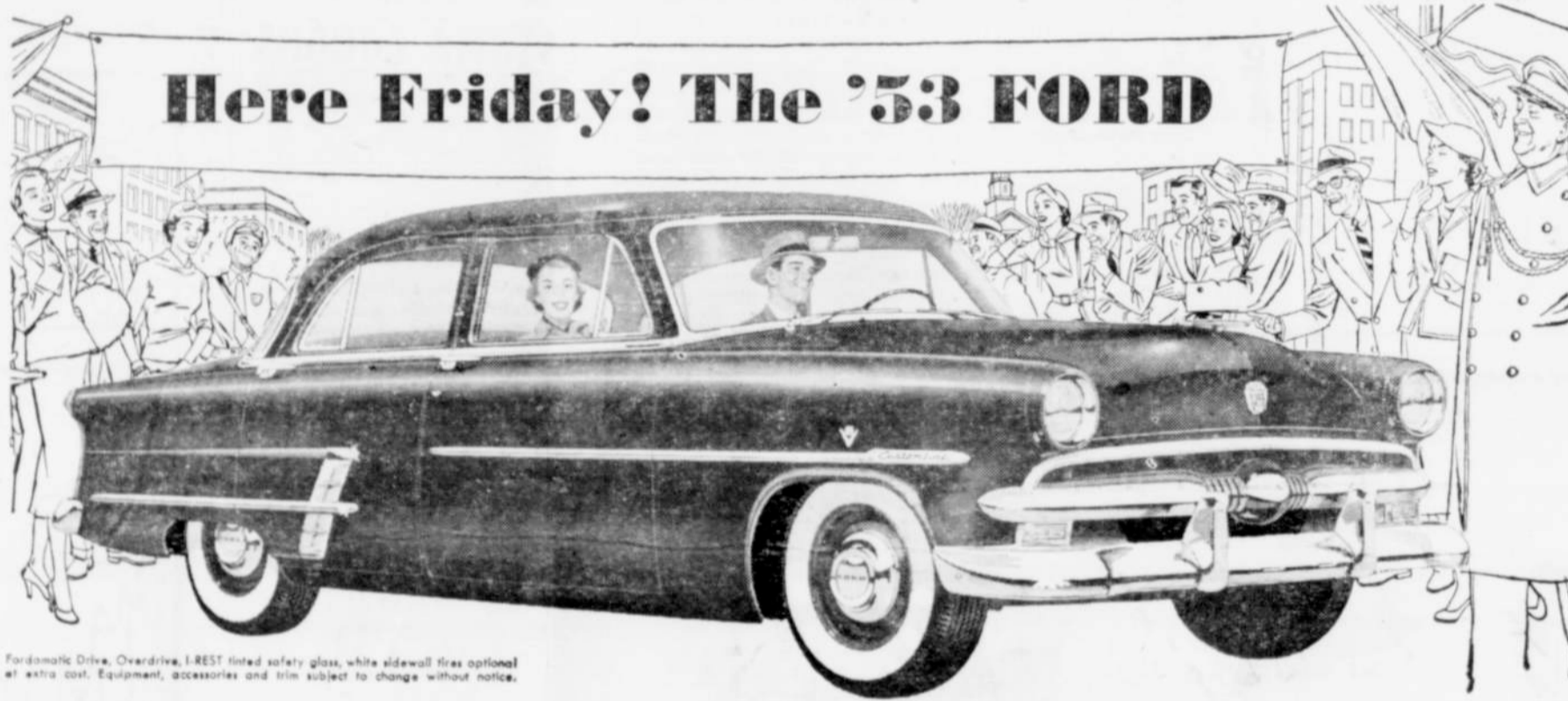
Fordomatic Drive, Overdrive, I-REST tinted safety glass, white sidewall tires optional at extra cost. Equipment, accessories and trim subject to change without notice.