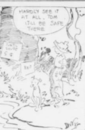
THEY TIED THE DUCK ALONGSIDE OF THE SHANTYBOAT AND CAMOUFLAGED IT