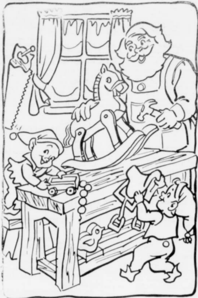
S ANTA'S TOYS FOR GIRLS AND BOYS!