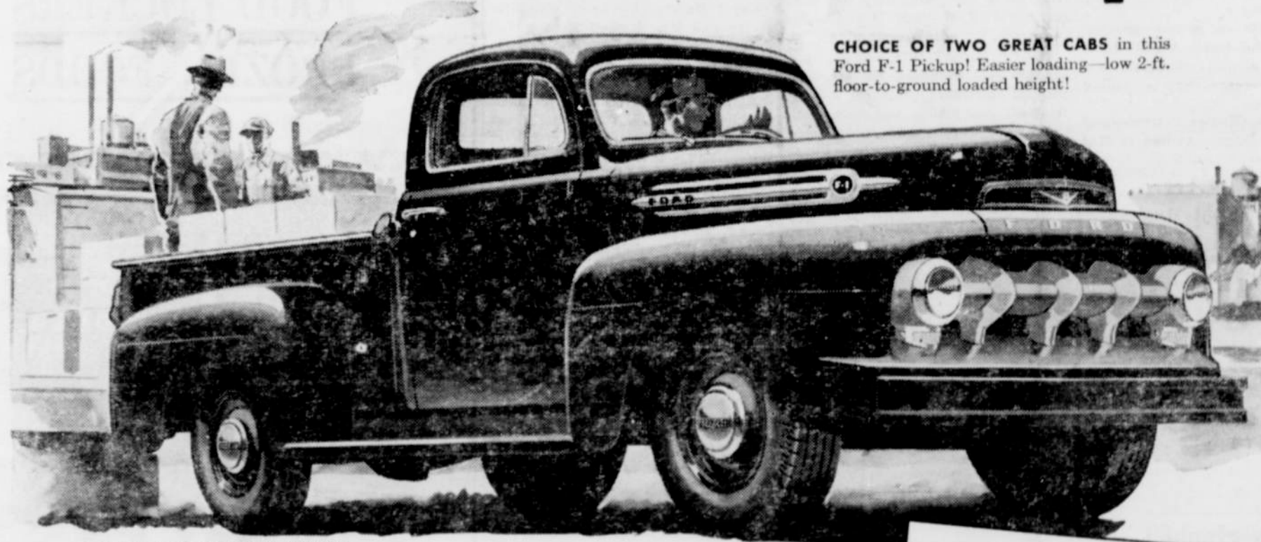
CHOICE OF TWO GREAT CABS in this Ford F-1 Pickup! Easier loading—low 2-ft. floor-to-ground loaded height!

It's a proven fact that 3 out of 4 Ford Pickups run* for less than 2 1/2¢ a mile!