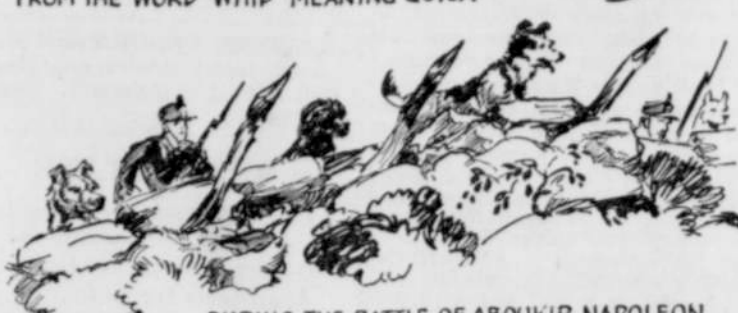
DURING THE BATTLE OF ABOUKIR NAPOLEON ADVISED HIS GENERALS TO USE LARGE NUMBERS OF DOGS TO GUARD THE FORTIFICATIONS

© 1952, Gaines Dog Research Center, N. Y. C.