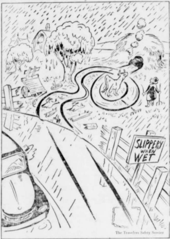
Lucky you—you ignored road conditions and avoided the hospital

Fryer will take a 9-months trade course in body and fender work.