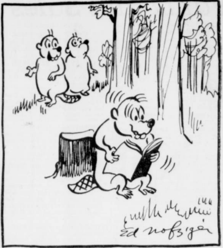
"He's got the 'Small Sawmill Operator's Manual' from the Forest Service, and boy has he improved his operations"