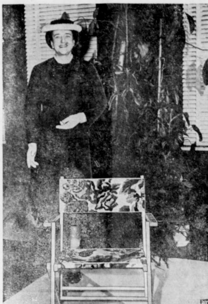
Lowly folding camp chair has been glamorized by Dorothy Draper, celebrated interior designer, by substituting her "Fazenda Lily" Schumacher print fabric for ordinary striped canvas with which inexpensive piece is equipped. Easy to do; only 2 yards of print material is required. Schumacher's now offers through interior decorators and leading stores all-weather-proofed printed materials for this "indoor-outdoor" purpose. So "sit pretty" on terrace, lawn or move inside on this "Cinderella" chair at modest cost. For how to make instructions write Schumachers, 60 West 40th Street, New York 18, N. Y.