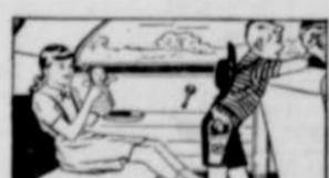
EXTRA STRENGTH AND COMFORT of Fisher Unisteel Construction