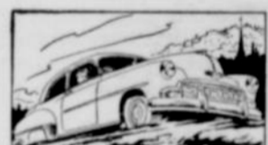
EXTRA SMOOTH PERFORMANCE of Centerpoise Power