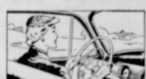
EXTRA STEERING EASE of Center-Point Steering