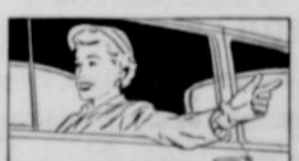
EXTRA STOPPING POWER of Jumbo-Drum Brakes