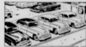
EXTRA WIDE CHOICE of Styling and Colors