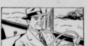
EXTRA SMOOTHNESS of POWER Slide Automatic Transmission

A complete power team with extra-powerful Valve-in-Head engine and Automatic Choke. Optional on De Luxe models at extra cost.