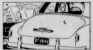
EXTRA BEAUTY AND QUALITY of Body by Fisher