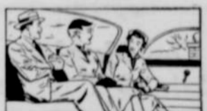
EXTRA RIDING COMFORT of Improved Knee-Action