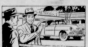
EXTRA PRESTIGE of America's Most Popular Car