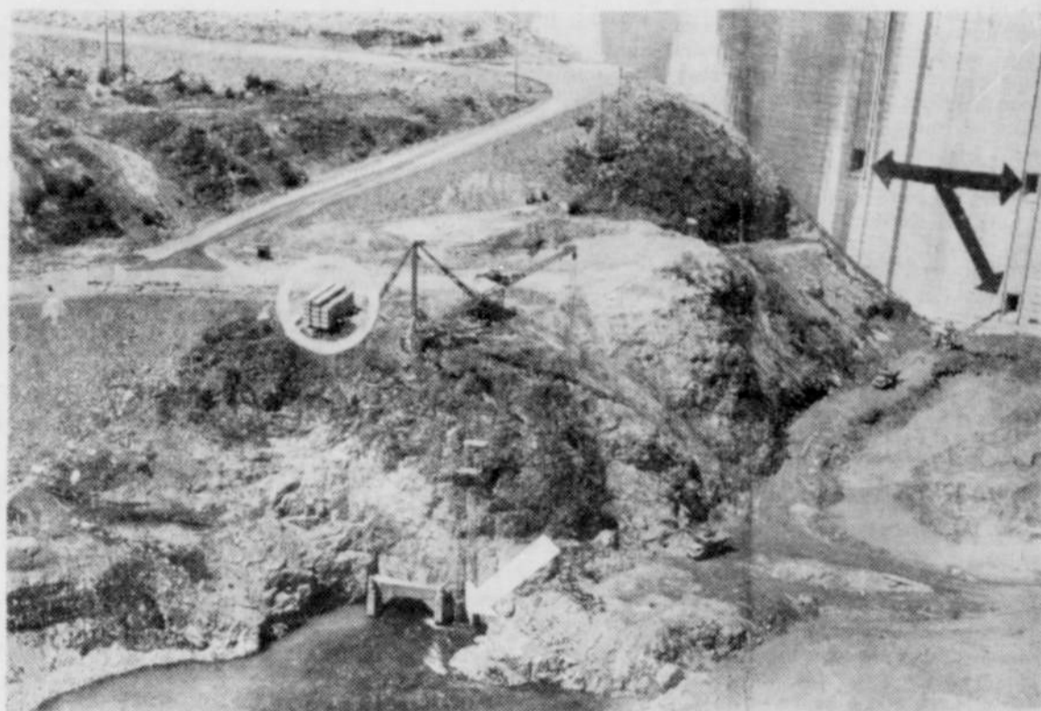
Engineers at Detroit dam are prepared to close the by pass tunnel, left center, next week diverting flow of North Santiam river into new reservoir.