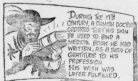
DURING THE 17th CENTURY, A DANISH DOCTOR CARED THAT HIS SKIN BE USED TO BIND A MEDICAL BOOK HE HAD WRITTEN, AS A SIGN OF GRATITUDE TO HIS PROFESSION. HIS WISH WAS LATER FULFILLED.