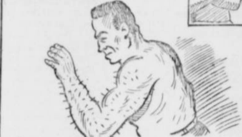
IN RURAL PARTS OF PRE-WAR SILESIA, A POPULAR PAST-TIME WAS THE PIN-STICKING CONTEST... TO FIND THE BEST HUMAN PINCUSHIONS! 20th Century 3500 NEEDLES WERE OFTEN IMBEDDED IN ONE ARM!