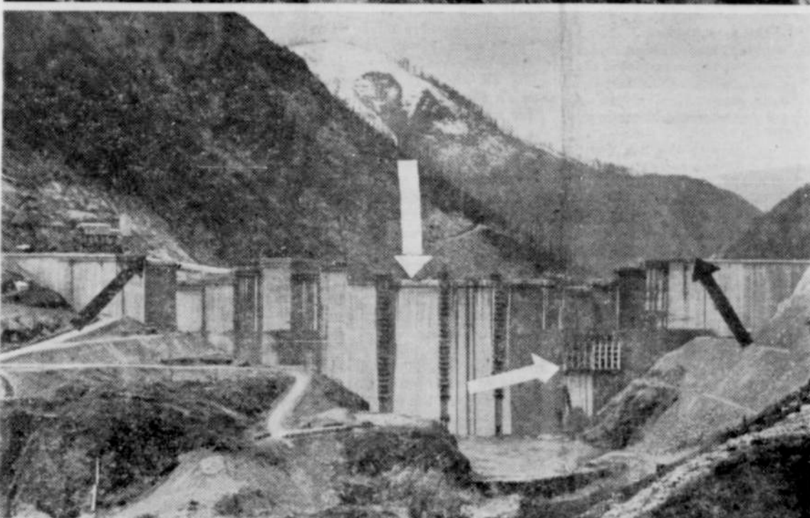
Detroit dam will soon be finished as workmen start pouring last top sections. Top photo shows west face of dam on downstream side. White arrow points to twin penstocks that will furnish water to turbines in powerhouse. Black arrow, center, shows top of spillway in center of dam. In lower photo black arrows point to top level of dam on eastern face. White arrow, right, points to intakes for penstocks. White arrow, center, points to top of spillway.