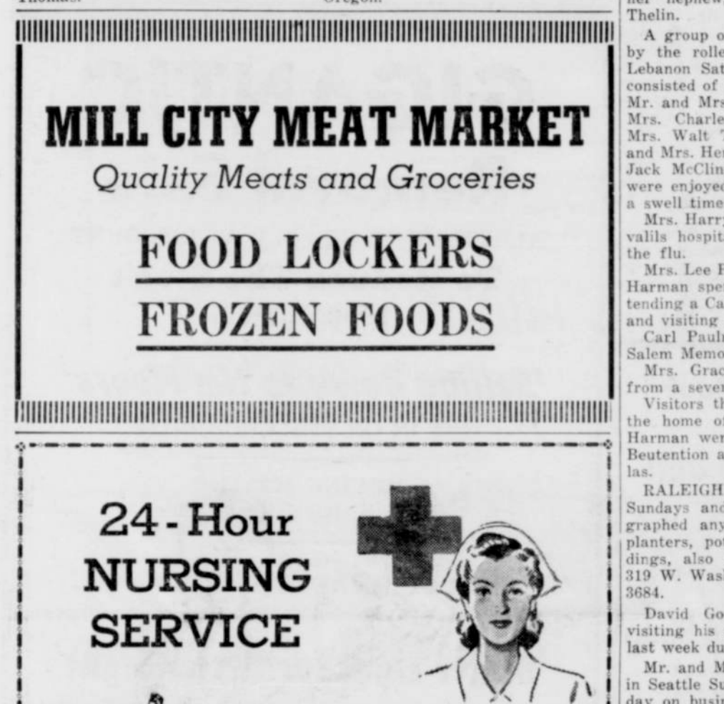
Accommodations For Women Who Are Convalescing and Need Medical Care