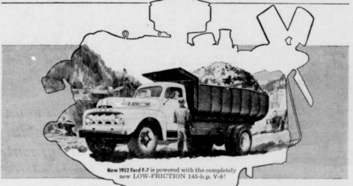
New 1952 Ford F-7 is powered with the completely new LOW-FRICTION 146-h.p. V-8!