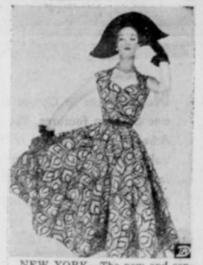
NEW YORK—The new and sensibly priced Paragon line of cotton prints by Fruit of the Loom

"Was a neryous wreck from agonizing pain until I found Pazo!" says Mrs. A. W., San Antonio, Texas Speed amazing relief from miseries of simple piles, with soothing Pazo! Acts to relieve pain, itching instantly—soothes inflamed tissues—lubricates dry, hardened parts—helps prevent cracking, soreness—reduces swelling. You get real comforting help. Don't suffer needless torture from simple piles. Get Pazo for fast, wonderful relief. Ask your doctor about it. Suppository form—also tubes with perforated pile pipe for easy application. *Pazo Ointment and Suppositories ©