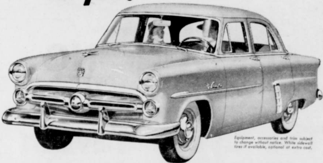
Equipment, accessories and trim subject to change without notice. White sidewall tires if available, optional at extra cost.

Find out what's waiting when you take the wheel! Ford's New Automatic Ride Control cuts sideways on curves, irons out the bumps. Includes lower center of gravity, longer rear springs, wider front tread and tailored-to-weight front springs.